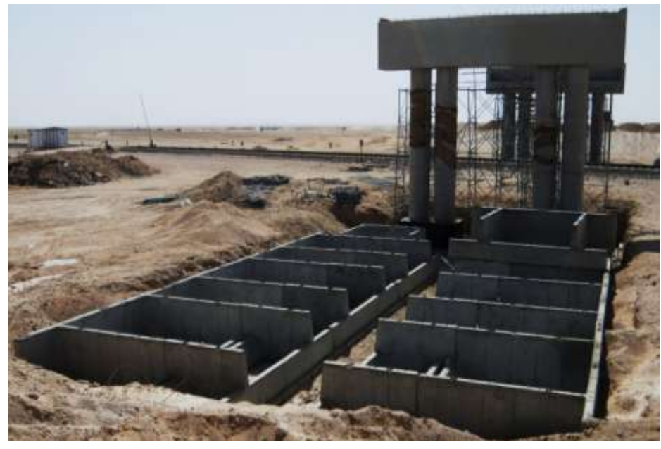
Start Erection of Retaining Walls for Ramps

Field Fabrication - of Units to Limit Transport to 100 miles